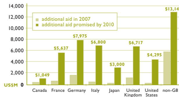
Source: OECD DAC online database Table 1. Figures are in US$million (2004 prices) and indicate changes since 2004 in ODA with debt relief deducted.

Unfortunately, three of the G8 donor countries – Canada, Japan and the United States – are likely to still be providing relatively low levels of aid as a proportion of GNI in 2010, even if they reach the commitments they made in 2005. Using current trends, the OECD estimates the following ODA/GNI ratios for these countries in 2010: