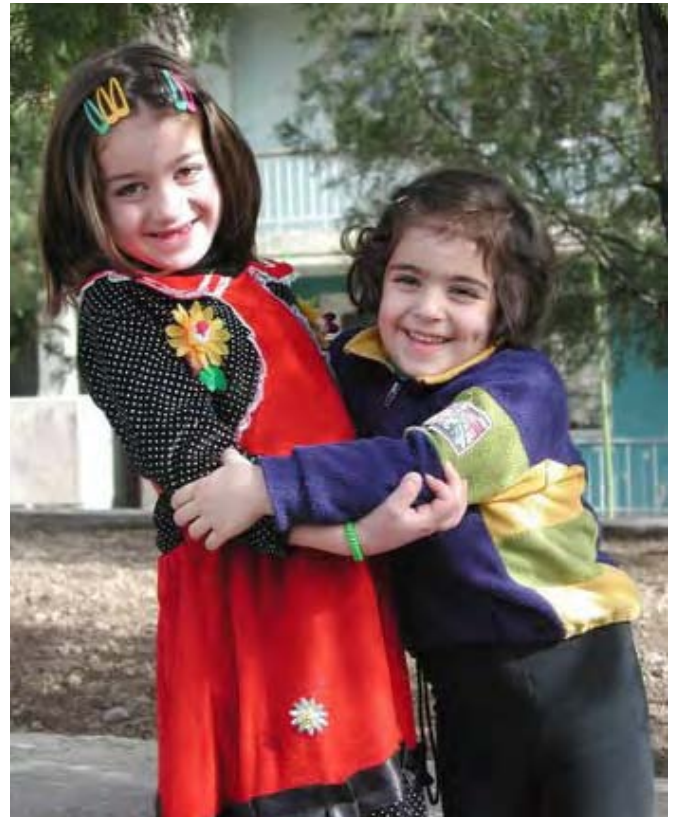
The objectives of WV Armenia and other NGOs should be to ultimately make institutions obsolete. Every child should live in families or in sustainable communities; the aim must always be for children to return to the family safely or be placed in a foster family or a “family-like” environment.

MSF supported Vardashen staff from 1997 to 2004 to set up educational and recreational activities for children, provide medical and psychological care and maintain contact between the children and their families, aiding the process of social reintegration. 7