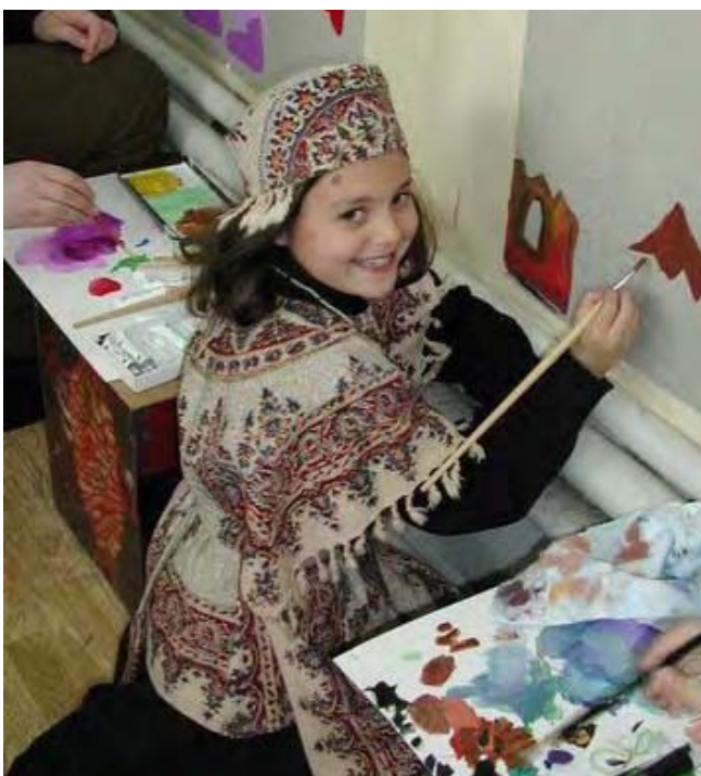
Innovative teaching methods help to improve the educational and recreational activities of children.

WV Armenia has emphasised vocational training opportunities by organising clubs to provide learning, life skills and play opportunities for the children living in institutions and those at risk of being institutionalised. Activities such as swimming, horse riding, sewing, theatre, shoe making, circus, art, fashion, and ceramic classes were initiated in the community, so that Vardashen's children can socialise outside the institution, learning with other community children and students of secondary schools. Vardashen's football team now competes with the teams of special and secondary schools. These interactions are crucial for integration.