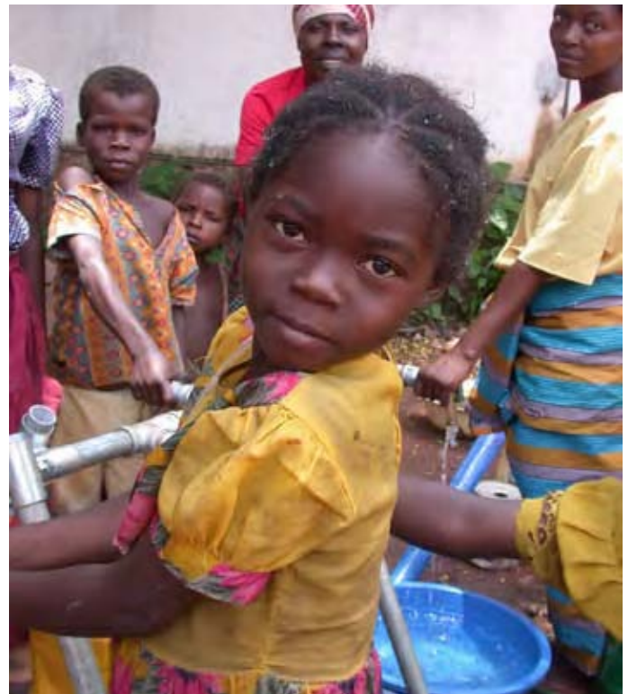
Girls in the DRC often queue for hours to collect water for their families.

The mothers know that their daughters do not have enough time to practice what they learn at school and they see the consequences, but offer no solution. They