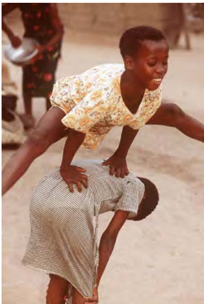
Children playing. World Vision encourages individuals to speak out and challenge the exploitive structures that cause their poverty. Many of these activities focus on the girl child, who will either continue the poverty cycle or be empowered to break it.