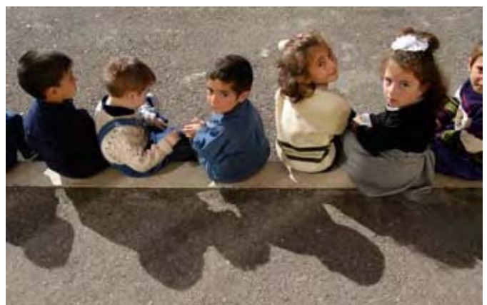
Children outside a neighbourhood school that is inclusive of children with special needs because of World Vision’s assistance in providing training, psychologists and social workers.

The programmes of residential institutions do not provide children with special care, vocational training or life skills. They do not support children’s reintegration into mainstream society or strengthen their connections with their parents or extended biological families. Most state institutions in Armenia have no social worker or psychologist to support children and their families. These factors, accompanied by a lack of housing, have created an ongoing children’s crisis. All residential care institutions are detrimental to children when they reside on a permanent basis outside of a family-based environment (articles 8 and 9 of the Convention on the Rights of the Child). 4