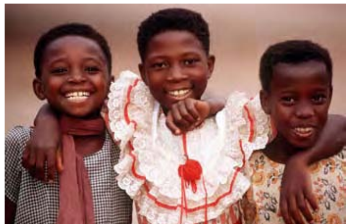
Villagers tend their cassava farm, which is 9 miles one way from their home plots. One man rides a bike each day on this journey but his wife walks the distance three times a week, after fetching water and cooking.

Rape cases are now common in Ghana, as in many parts of Africa. Women and girls go through great trauma and, at times, die as a result of rape. The HIV and AIDS cases among young women and girls in Africa continue to grow, bringing with this tragedy additional social problems.