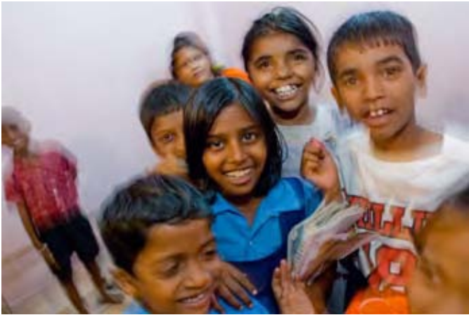
Non-formal Education class for Mumbai children who are unable to go to regular school. Staffed by enthusiastic volunteers, the programme prepares kids to be able to attend regular schools. The classes are held at night, from 7-9.