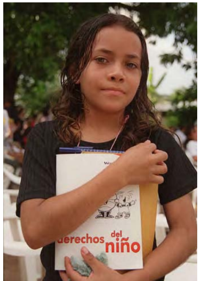
At a conference on "Good Family Treatment" in El Salvador, boys and girls discussed ideas about how they expect to be treated by adults.

By examining the educational environment of the girl child and some of the worst forms of exploitation that harm girls in El Salvador, this paper offers recommendations to eliminate discrimination and violence against the girl child.