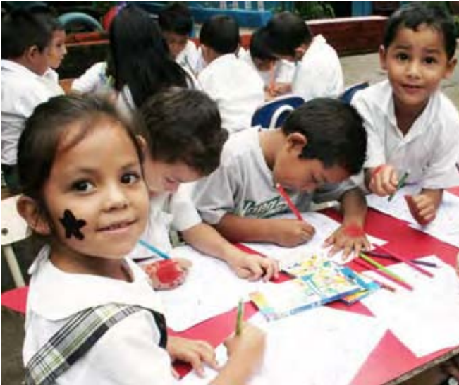
Children draw, paint, and participate in diverse activities that educate them in human rights

human rights, such as Environmental Unity (UNES), and church groups.